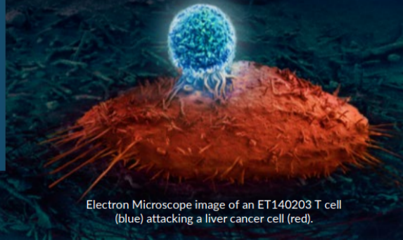
Electron Microscope image of an ET140203 T cell (blue) attacking a liver cancer cell (red).

Eureka Therapeutics, Inc. is a clinical-stage biopharmaceutical company developing transformative technology platforms that can access cancer-specific targets and harness the evolutionary power of T cells for the treatment of solid tumors and other malignancies.